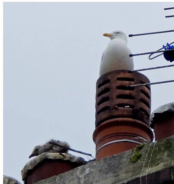
Herring Gull with young, Corn Park, 9 Jun 2025.