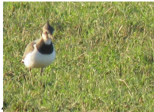
Lapwing , Elwell, 19 Jan 2024. Recorded in eight squares since 2017, but in none during 2014–6.