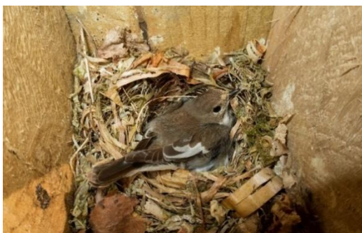
Pied Flycatcher , female on nest in Glaze valley box, 19 May 2018. The first parish breeding record since at least 2014.