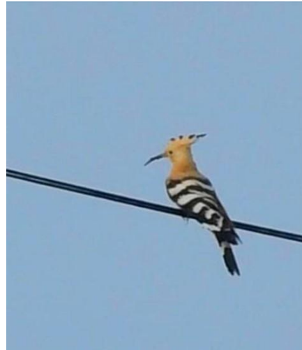
Hoopoe , Upper Webland Farm, 25 Oct 2023. The fourth parish record.