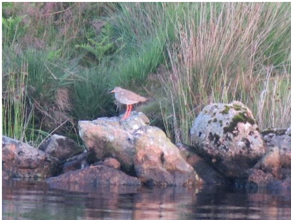
Redshank , Avon Dam, 16 Jul 2020. The first parish record.