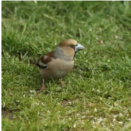
Hawfinch, Hillside, 3 Apr 2018. The second parish record after one in Jan 2018 which was included in TBOSBP.