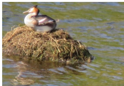
Great Crested Grebe on nest, Avon Dam, 2 Jun 2022. The first parish breeding record.